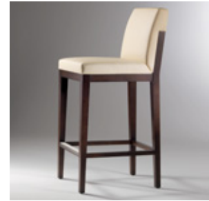
Barstool offering expands location possibilities