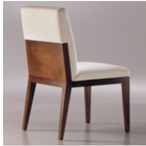
Wood and upholstery are beautiful counterparts

Appealing contrasts mark the Alia chair. Plush, two-inch-thick cushions rest on a solid hardwood frame of mortise-and-tenon construction. A maple veneer panel extends up the chair's back for a pleasing complement to the upholstery material. The rounded edges of seat and back harmonize with the crisp edges of the chair's frame and legs.