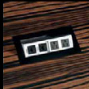
Flip-up power/data unit provides convenient access at the tabletop