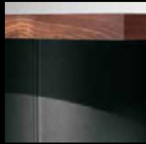
Stitching detail is evident on this cylinder base covered in optional Faux Leather