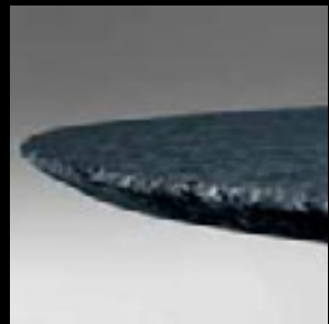
The reverse bevel edge on this granite top creates an elegant profile