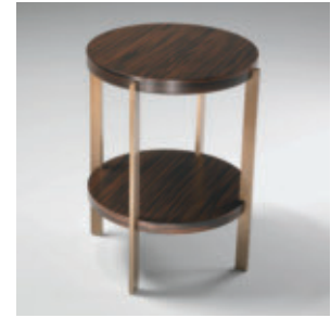
Notched legs serve as connection points for top and shelf