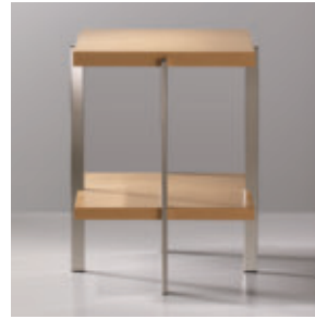
The interplay of square shapes and bold legs lends an architectural air to this piece