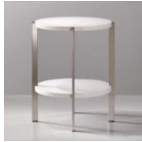
Top and shelf in durable solid surface contrast with polished metal legs

Elemental forms—from ovals to circles to squares—give Morgan tables their distinctive appearance. These foundational pieces can be tailored to complement areas as divergent as a private office or a public lobby. Their versatility stems from a combination of clean lines and expansive choices for tops and legs. Models include side, coffee, and console.