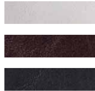
Choice of leathers for top, bottom and leg in, light, medium and dark palette