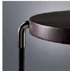
Stainless steel detailing contrasts with woven leather