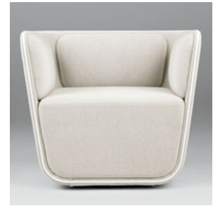
The lounge chair carries an uninterrupted line from front to back and top to bottom