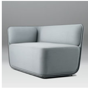
Modular components include ganging mechanisms for secure connection

The Elle lounge chair, sofa, and modular seating share continuous lines that convey fluidity and motion, inspired by the energy of skateboarding. Planes and lines combine for a youthful elegance and a fresh style.