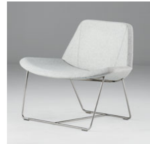
The lounge chair is supportive of casual and formal sitting styles