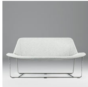
A sofa offers comfort and flexibility for collaborative environments

The Current Lounge Seating was the starting point for the entire Slide Collection, pieces that are mobile, comfortable, and flexible to suit the way we work now. David MocarSKI designed the lounge chair with extended "wings," for flexibility in ways of sitting, from casual to formal and even cross-legged.